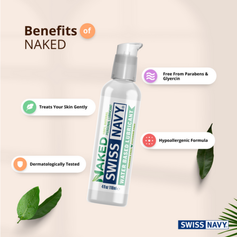
Benefits of NAKED Lube