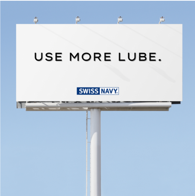
Use More Lube Billboard