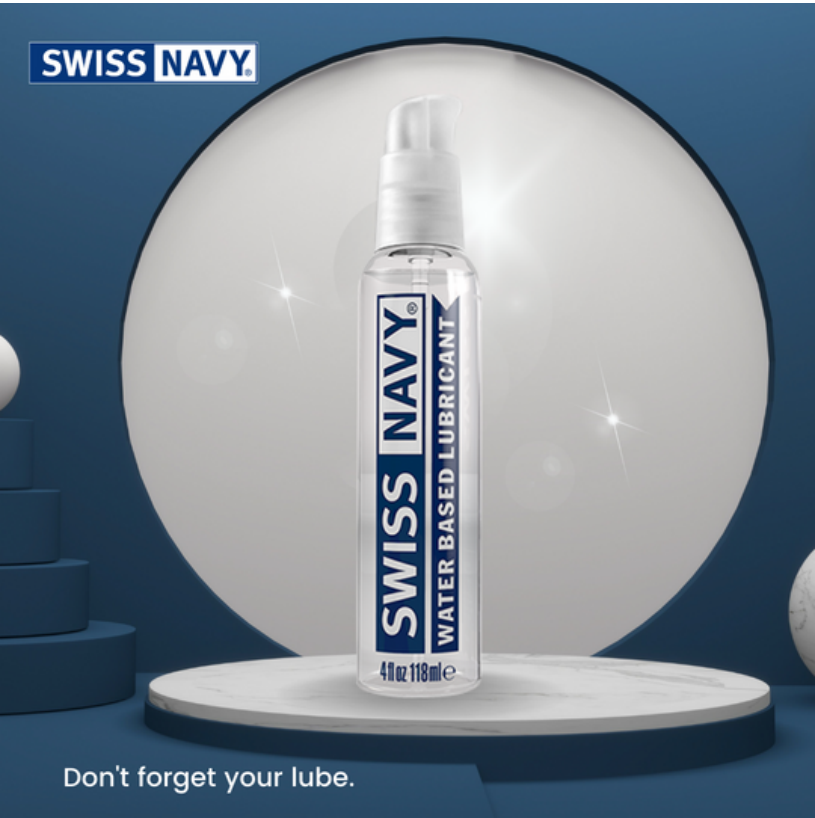
Don't Forget Swiss Navy's Water-based Lube