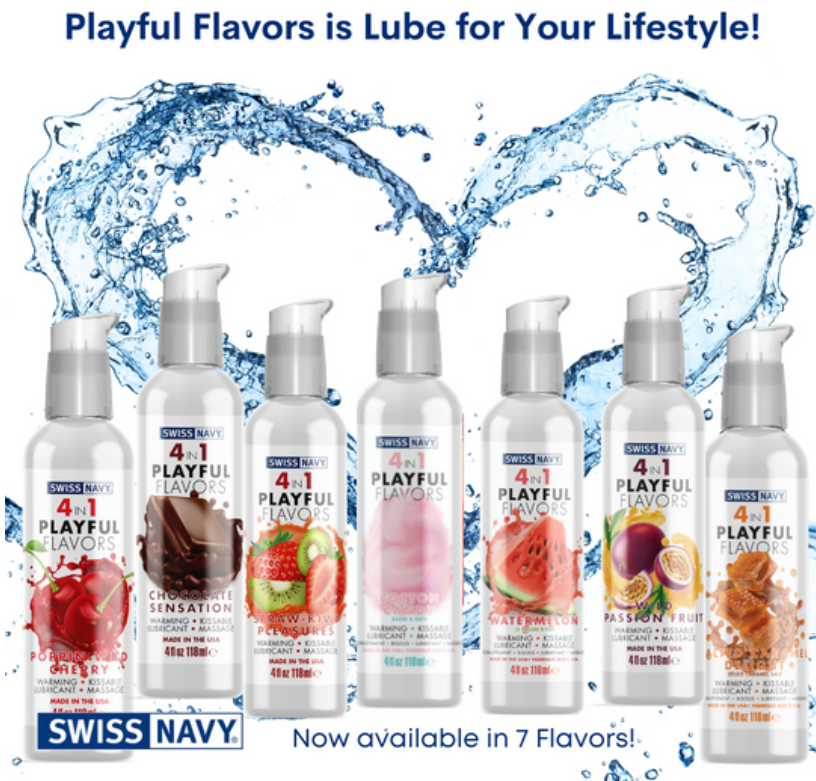
Playful Flavors now available in 7 Flavors