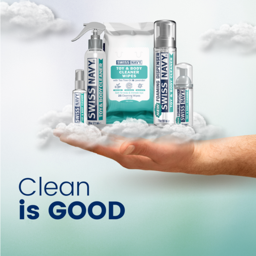
Clean is GOOD