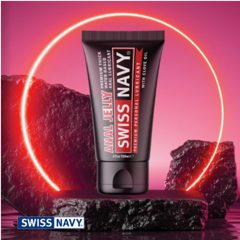
Anal Jelly (Red)