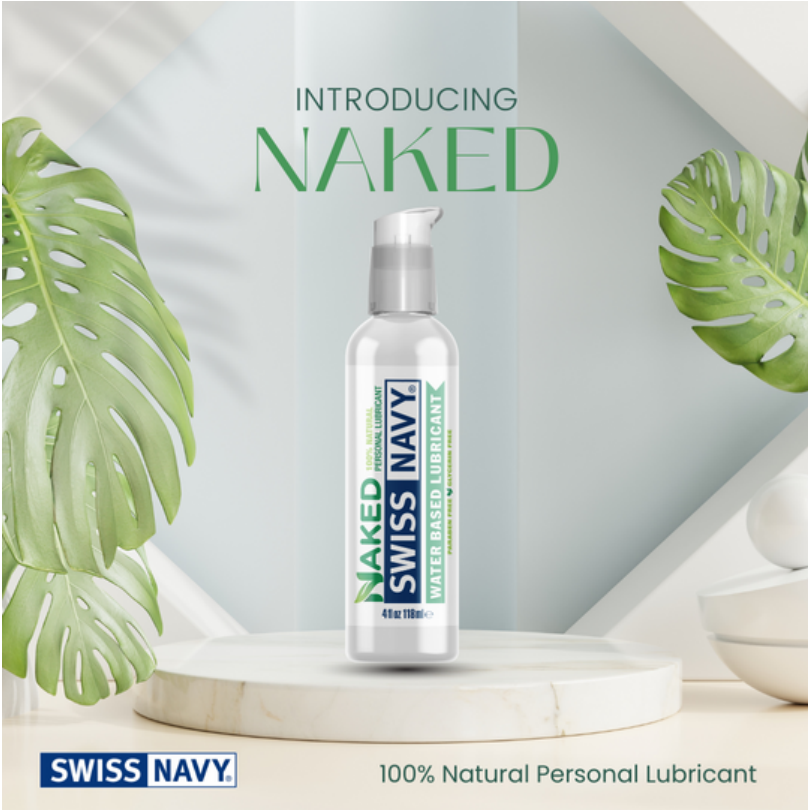
Introducing NAKED Lube