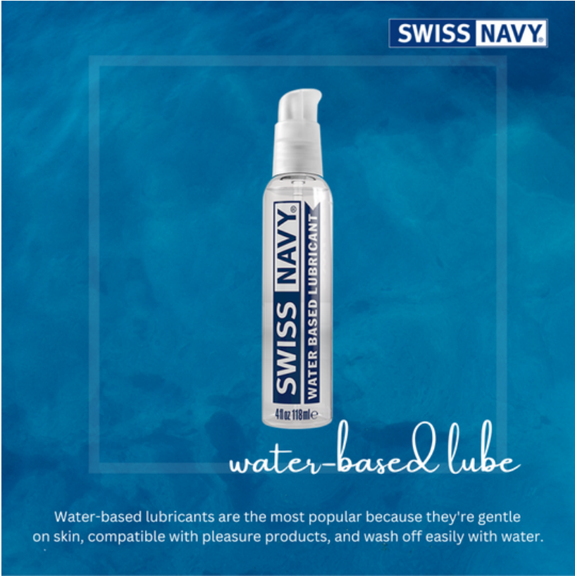
Water-based Lube is the most popular