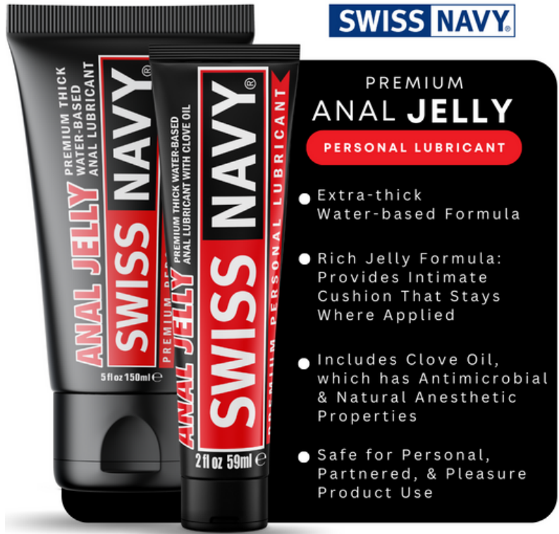
Anal Jelly Features