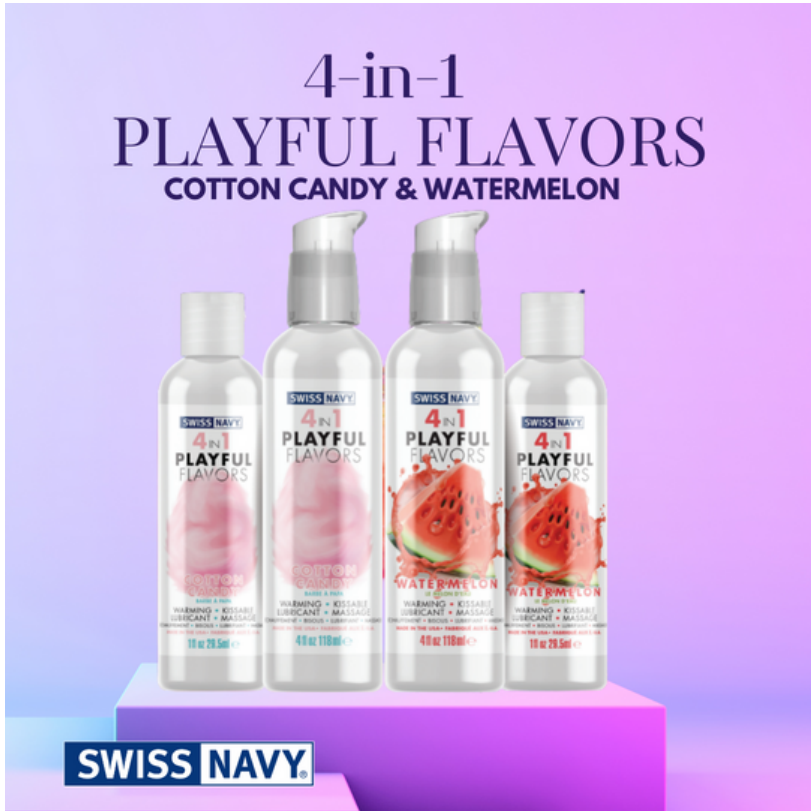
Newest Playful Flavors: Watermelon & Cotton Candy