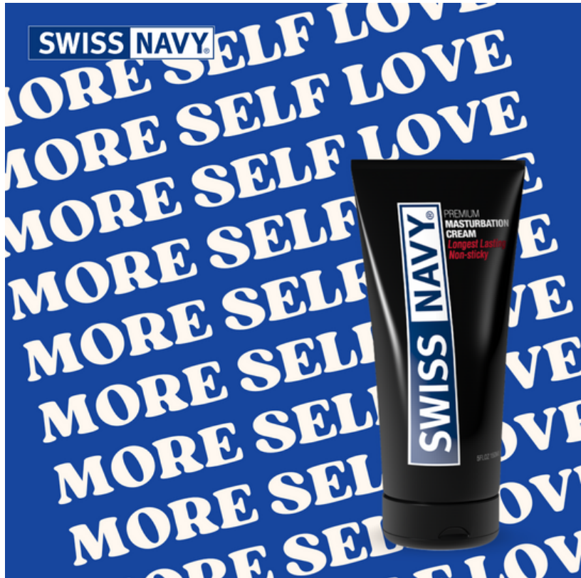
More Self Love