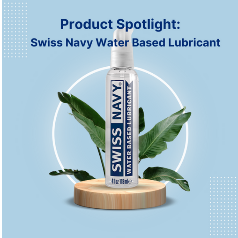
Product Spotlight: Swiss Navy Water-based Lube