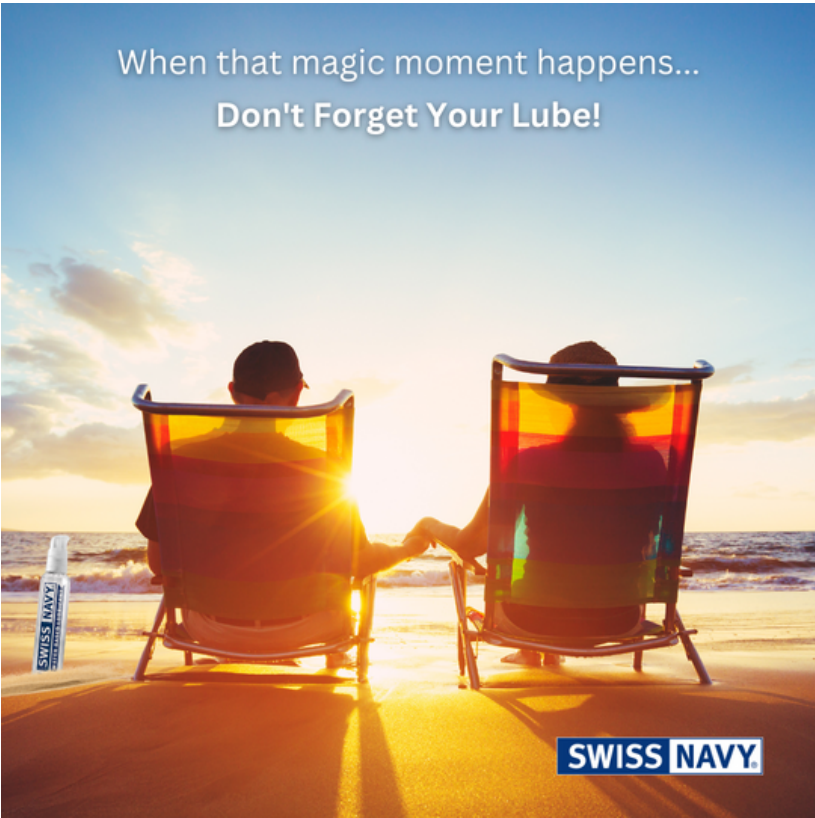
Magic Happens: Don't Forget Lube