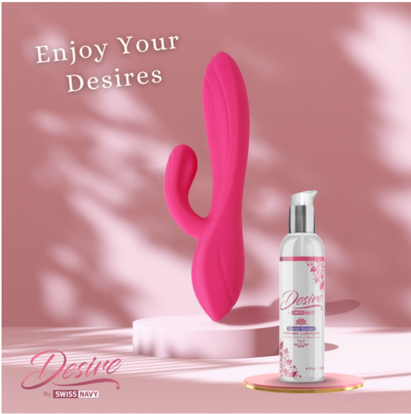
Enjoy Your Desires