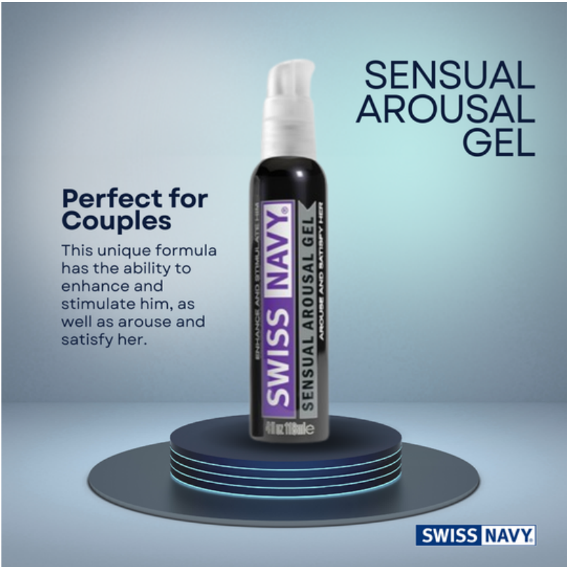
Sensual Arousal Gel