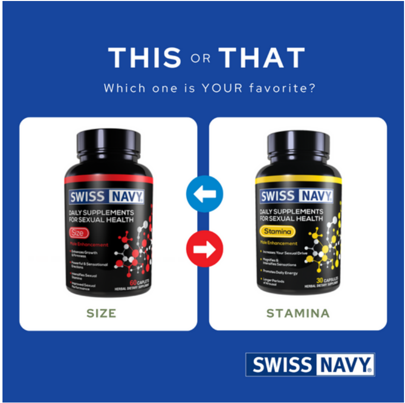
This or That: Size vs Stamina