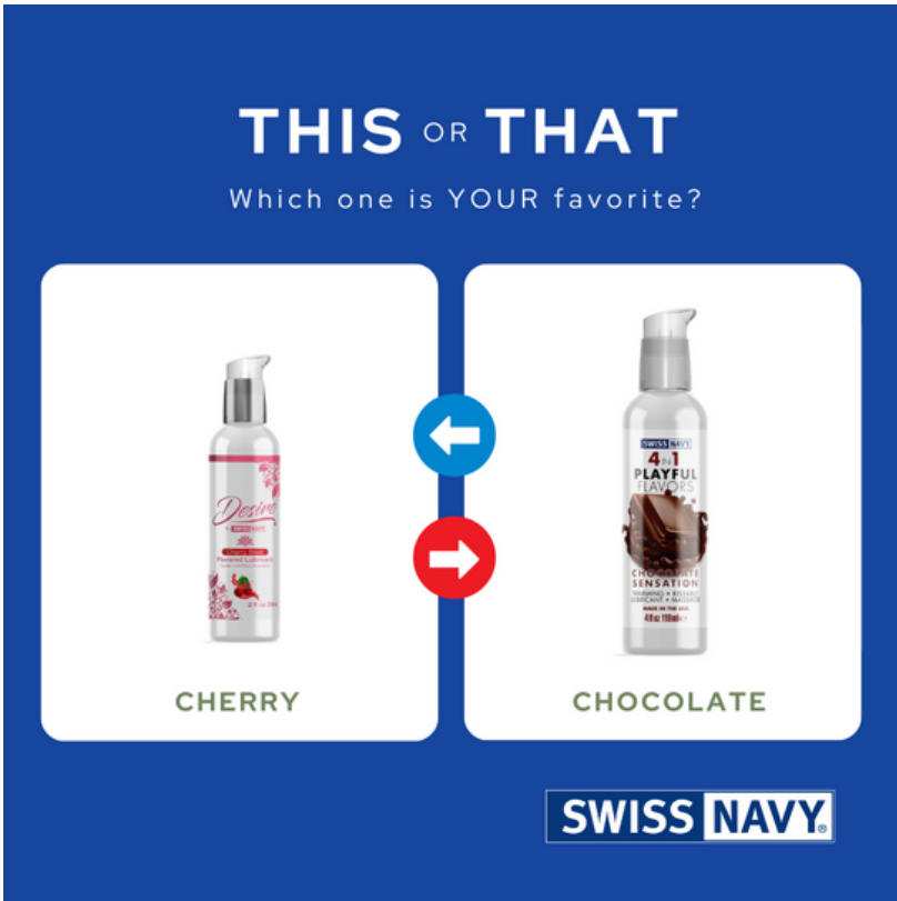
This or That: Cherry vs Chocolate