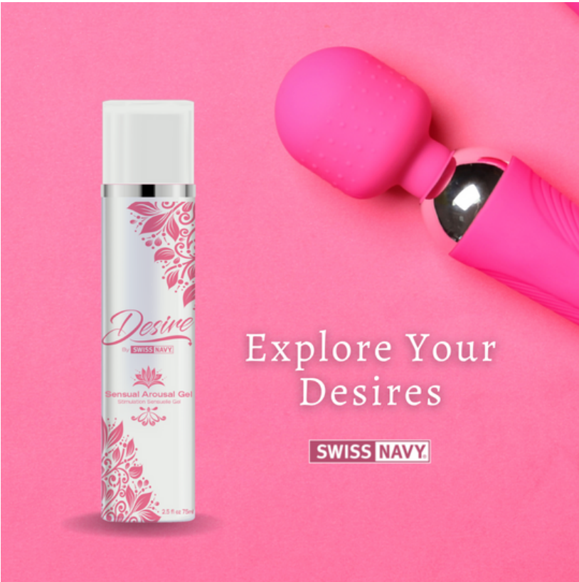
Explore Your Desires