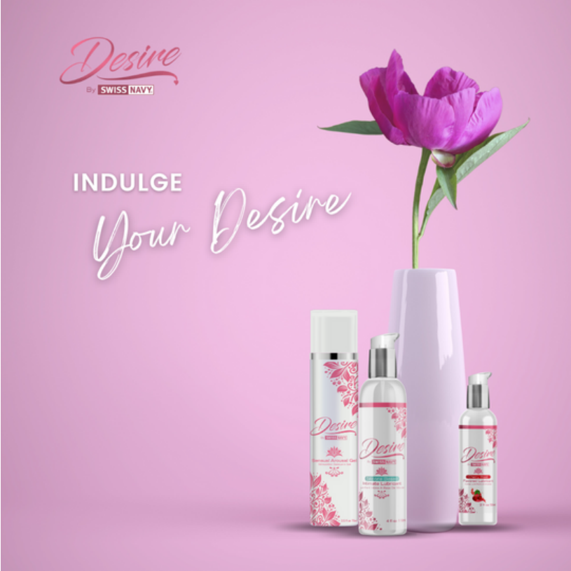
Indulge Your Desires